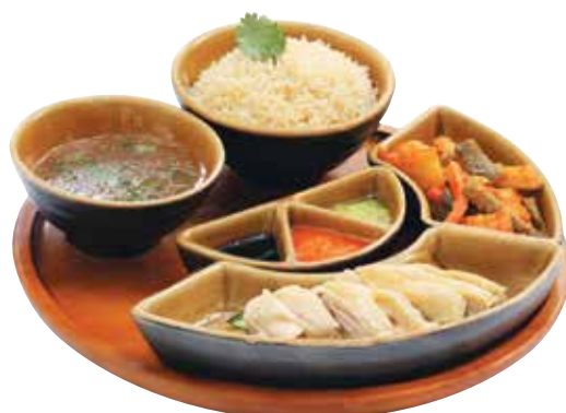
Hainanese Chicken Rice

enjoy 10% off the food bill. Aside from its lunch and dinner menu items, the café also serves snacks and desserts such as Chilled Longan with Chin Chow and Mango Pudding for satisfying those in-between meal cravings. With its pleasant airy layout and casual ambience, J Café is another extension of what the Group does best – bonding people through food.