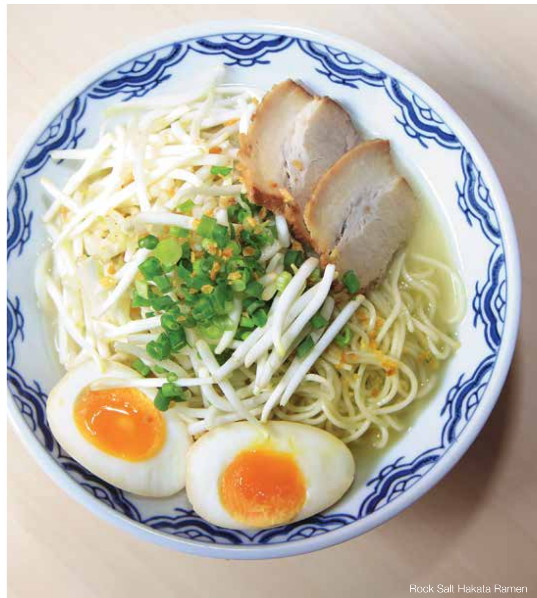
Rock Salt Hakata Ramen