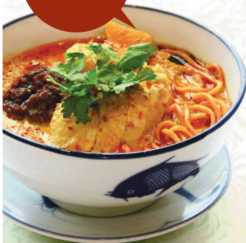
Curry Chicken Noodles