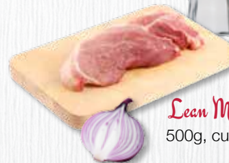
Lean Meat (Pork)